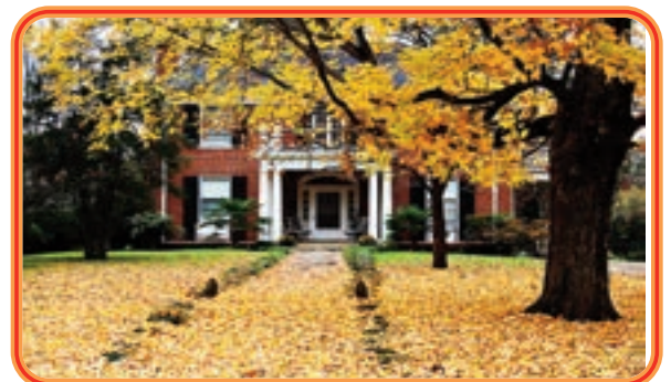
By The End of November, One Knows Winter Is Coming!

If only from the standpoint of supplying energy for growing more roots (the essential foundation for plant health & beauty), fall fertilizing is very important for your entire landscape.